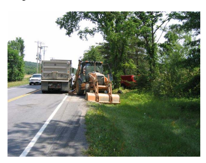
Figure 1. Accident site showing the asphalted road affected by spill.

A tractor/trailer was involved in a highway accident in WV releasing approximately 75 gallons of diesel fuel from a ruptured saddle tank. Free petroleum product flowed into the gravel alongside road shoulder and adjacent embankment. The site is a single lane, north/south highway of typical asphalt paved construction (Figure 1). Road shoulders are intermittent gravel, grass and embankments. Potential receptors are human, wildlife and groundwater. Multiple major underground communication utilities lines were present in the accident area making it difficult to excavate.