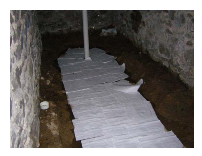
Figure 1. Basement immediately after removal of dirt

In February of 2005, a release of between 150 and 200 gallons of #2 fuel oil occurred at a residence in Blandon, Pennsylvania. The released fuel oil entered the basement of the residence, covering a 200 square-foot area. The spill was responded to immediately by local environment agency and the response actions included removal of the concrete floor and underlying soils.