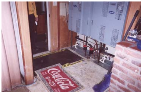
New furnace installed in less than three weeks after treatment with VaporRemed®