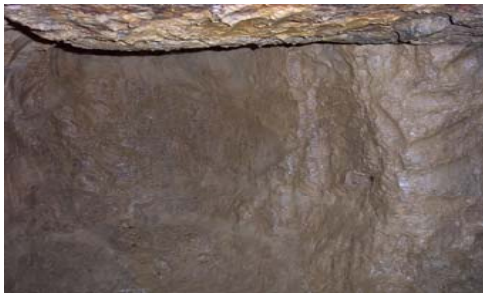
Excavated pit sprayed with VaporRemed® removed fumes in minutes.